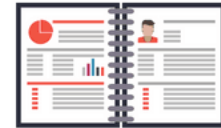
No Permission for Data/Information Usage